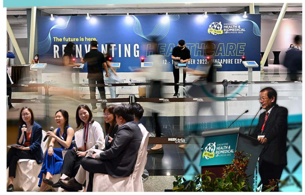
Singapore Health and Biomedical Congress 2022 Special