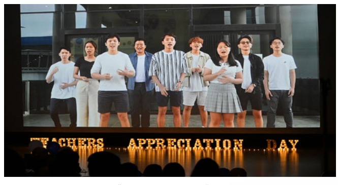
Acapella performance of "Just The Two of Us" by LKCMedlee, students from the Lee Kong Chian School of Medicine.

well-wishes from Heads of Departments, esteemed guests and VIPs for 10 Years of Teaching Excellence made possible by the strong collaborations and commitment of educators in YH and NHG.